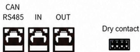
Battery communication interface preview